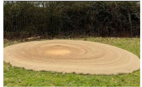
Ruislip tunnel Foam incident

Troubles started when the bottom of the tunnel entered the chalk aquifer which is saturated with groundwater. Also being disturbed above the chalk, is a layer of black clay made of previously unknown material that HS2 are calling the Ruislip formation.